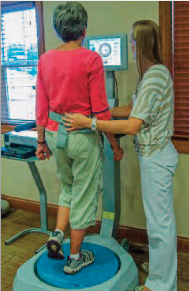
Biodex Balance System SD helps balance-challenged seniors recover the ability to properly weight shift.

“A lot of times, it is difficult for a dementia patient to follow multiple directions, but with the Biodex systems, they are usually able to follow directions well enough to complete a task. They are also willing to chance getting their center of gravity in different positions outside their sway envelope, which they are not typically used to doing.”