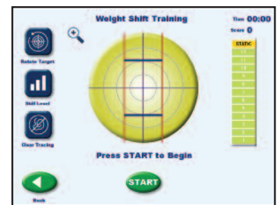
Performance screens and printable reports demonstrate patient progress and proves need for continued therapy.

As Lighthouse residents perform the programmed exercises embedded in the Biodex Balance System, they can see the effect of each weight shift on a large LCD touch screen. The Balance System stores prior session exercises, and enables output reports of repeated session performance, documenting improvement for reports to private payers and Medicare. Similar documentation is generated by each resident’s sessions on the Biodex Gait Trainer.