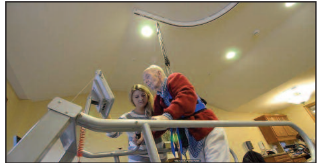
With a patient in the FreeStep, we can give tactile cues that we would not be able to provide without the protection of the harness.

“Similarly, with a patient in the FreeStep, we can give tactile cues that we would not be able to give without the combination of the harness protection and the Gait Trainer. We can use our free hands to tap their legs or give them feedback to let them know when they should be firing what or how they should be moving their leg while they are on the Gait Trainer, in the safety of the harness.”