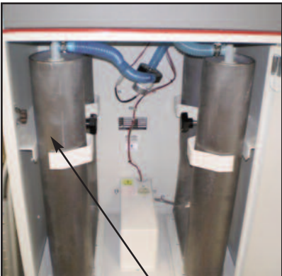
Figure 5 New Cartridge