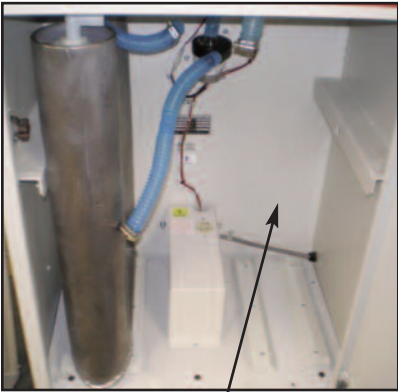
Figure 3 Remove Cartridge