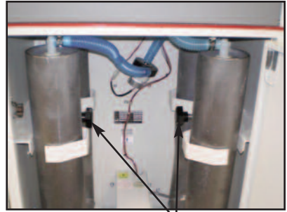
Figure 2 Remove Trigon Knob